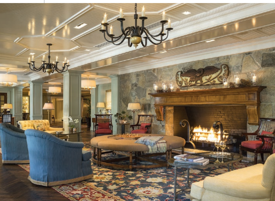
WOODSTOCK INN & RESORT

It's relaxing just to walk into the light-filled great room at the resort's LEED-designed spa. Vermont-inspired treatments reflect the changing seasons; last summer, local honey was the star of a hydrating Bee Pampered seasonal treatment. Shaker wood stoves and a Scandinavian sauna add to the refined-rustic ambiance, while a four-season outdoor courtyard features an inviting whirlpool and outdoor fireplace.